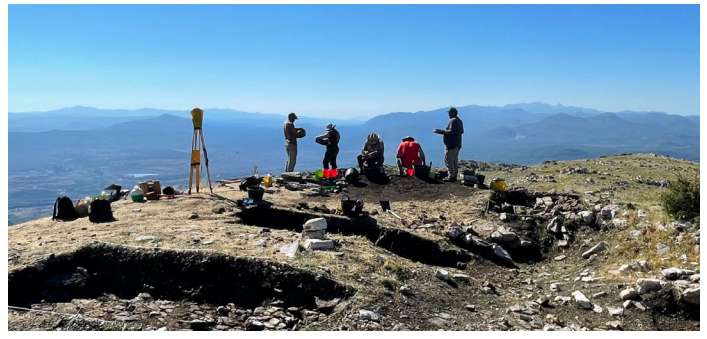
Trench Z: Altar of Zeus, looking southeast. Stephen Czujko, Rebecca Sanders, Kyle Mahoney, Luke Munson and Bobby Gamba.

Work continued on the southern peak of the mountain at the ash altar of Zeus. Following our standard procedures, all ash and soil was screened. We worked in several parts of the trench, now a total of 18 m in length with extensions to the east and west. We excavated at the far south, north, and in several areas to the east and southeast of the previously excavated architectural platform at the highest point of the mountaintop. We found what is likely to be the continuation of the altar's rubble retaining wall that has been defined to the west. Pockets of Early Helladic pottery were discovered in the area immediately south of the heavy concentration excavated in 2019. Two deposits of Late Helladic and Early Iron Age fineware were found. A nearly complete wide mouthed jar, likely Middle Helladic III - Late Helladic I date, was uncovered in a dump area to the east of the architectural platform,