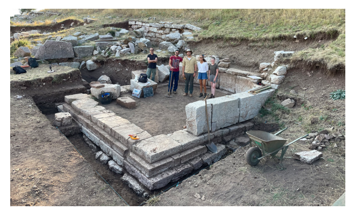
Trench EEW: Ionic Building, looking southeast. Takis Halvas, Michalis Mantzioris, River Ramirez, Tabitha Rodriguez and Andrea Riehle.

Turning to the Lower Sanctuary, we continued cleaning the approx. 6 x 8 m Ionic prostyle building located to the west of the stoa. We removed, labeled and photographed all the blocks and stones that had fallen from the back and western side walls into the building's interior. These blocks and stones were moved to the north of the building. We exposed the foundation courses on three sides, including the stylobate and two courses of the stereobate, and the lower foundations to the west and east. One of the marble Ionic column bases was discovered by the front stylobate, and several portable marble architectural blocks were moved to our apotheke.