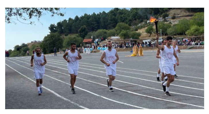
Lykaion Games Torch Run.

On Sunday August 7th, the 13th Modern Lykaion Games were held on the site of the ancient Lykaion Games, the mountain plateau beneath the altar of Zeus. The games were scheduled for 2021 but were postponed due to the global pandemic. Early in the morning the lighting ceremony for the games was held at the southern peak of Mt. Lykaion followed by the lighted torch being brought to the site of the stadium by a team of runners, several of whom have been our workmen! What followed were age group contests for boys and girls and men and women. The track is not a standard 400 m length, being somewhat less, and times are not kept for the runners.