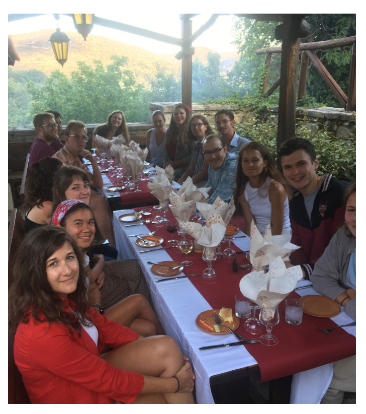
Fourth of July party at Abeliona, University of Arizona Team 2022.