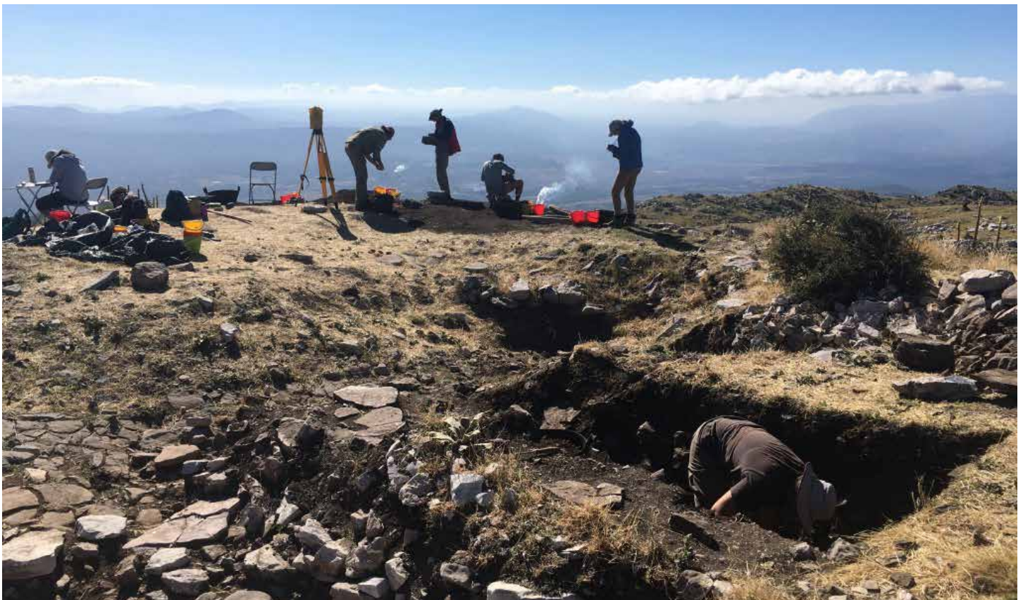
Altar looking southeast, Trench Z

Excavation continued in an area 45 m below the altar in an area identified as the “Pvrotostadium,” along a narrow north-south terrace between two sloping hillsides.