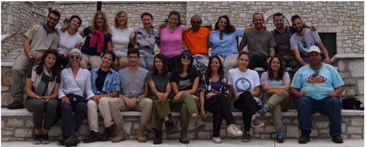
Arkadia Ephoreia Team

Midway between the upper and the lower sanctuary a rectangular reservoir building of 5.30 m wide and a maximum preserved length of 11 m oriented northeast-southwest was unearthed, of which only the southwest portion is preserved.