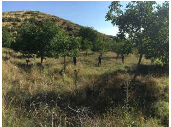
Survey team and others undertaking a pedestrian survey East of the Lower Sanctuary

Further information about the summer is found on our two websites: