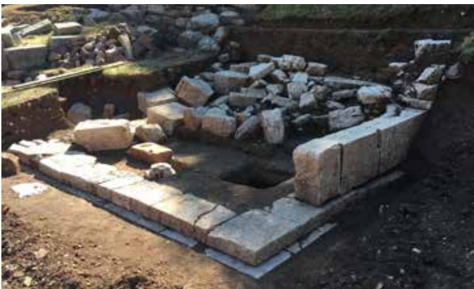
Ionic Prostyle Building, Trench EEW

We continued to clear the Ionic Prostyle Building that is located immediately to the west of the stoa and have now exposed all four sides as well as the interior of the structure. We have been working to define the exterior and to clear the interior of the building of rubble.