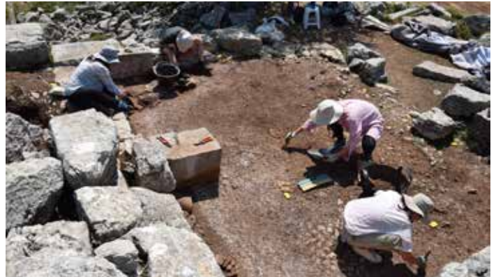
Excavation work on the pebble floor at the Bath. Pictured: Athanasia Theodoropoulou, Thomais Sakellaraki, Eleni Gaitani, Rebecca Fousianiv

Furthermore, the north elongated room was excavated along with the removal of the building material that had collapsed inside it. From the preliminary examination the pottery dates to the 4th century BC.