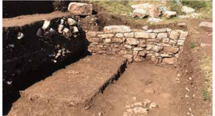
Interior Wall of the Administration Building in Trench LL

We expanded the trench in the interior of the administrative building continuing to look for the floor surface and the levels of use. A north-south interior wall of the building was discovered and partially excavated.