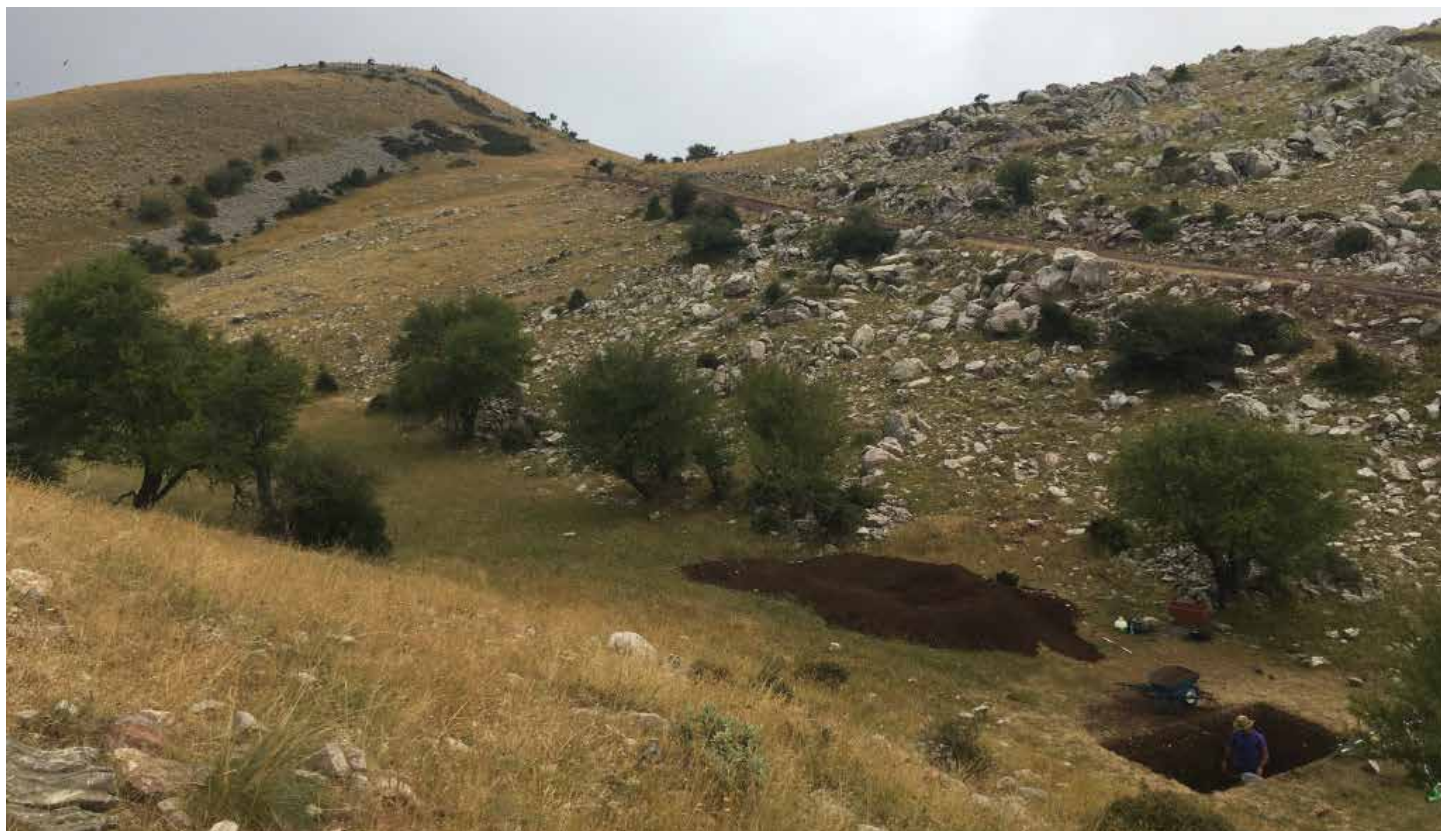
Trench SS in the Protostadium under the direction of Ryan Culpeper within view of the southern peak of the mountain.