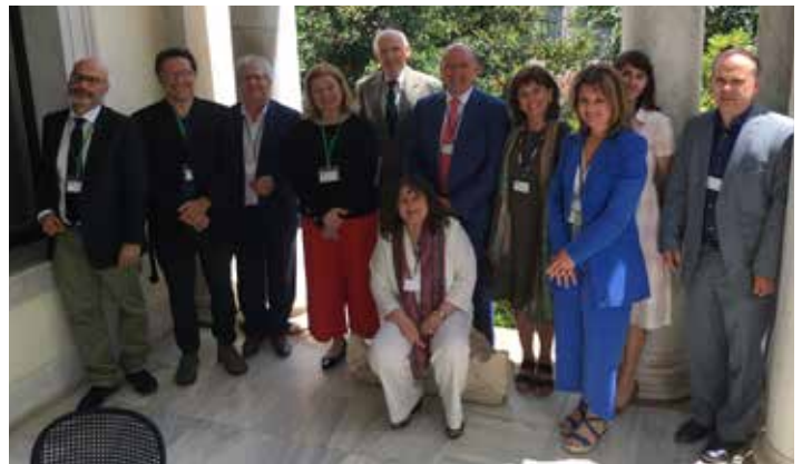
Speakers at the conference in Athens, May 31st, 2019 at Loring Hall of the American School of Classical Studies at Athens.