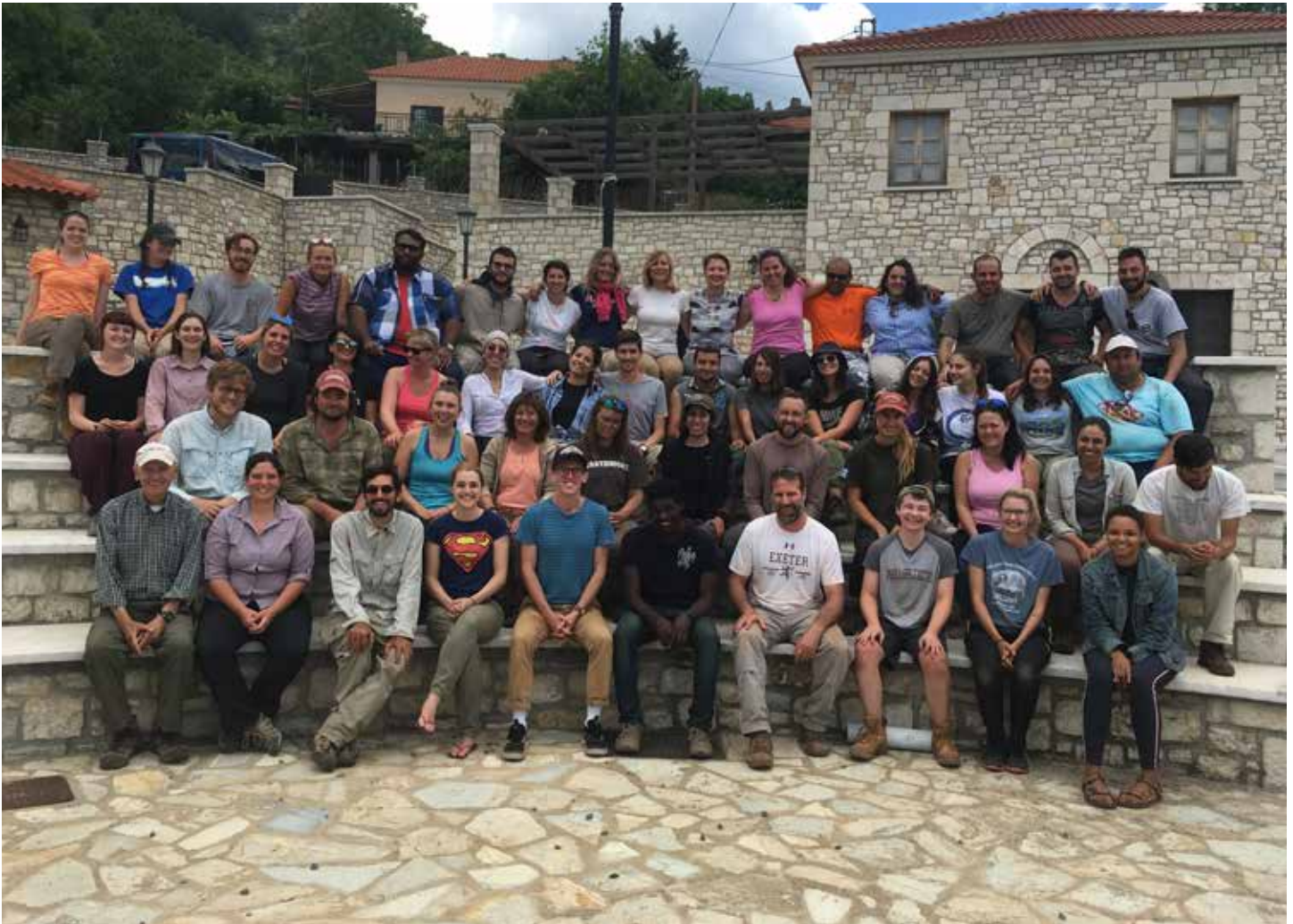
The combined University of Arizona and Arcadia Ephoreia Team, 2019