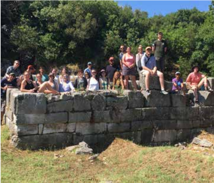
Field Trip to the Temple of Athena at Phigaleia.