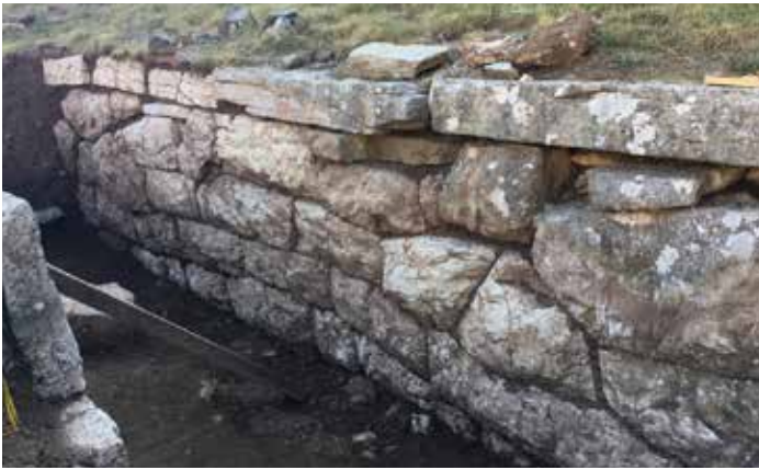
Retaining wall of the Stoa, Trench DD

In the lower mountain meadow, site of the lower sanctuary, we continued our work in the area of the western end of the stoa, where we dug between the back wall and the retaining wall of the building discovering a passageway that must have been used for the maintenance of the building.