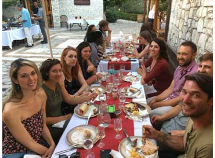
Dinner at the Abeliona Retreat on July 4th.