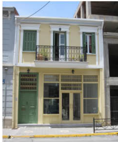
Clockwise from right: view of apotheke (storage space) in downtown Tripolis; Visit of Nicholas and Athena Karabots to the village of Ano Karyes to meet with Megalopolis Mayor Takis Bouras and village leaders; vertical banner that was produced for the August 1 presentation of the Parrhasian Heritage Park to over 200 individuals in the Cultural Center of Megalopolis. Multiple banners were hung in the city streets of Megalopolis in the days preceding and following the presentation.