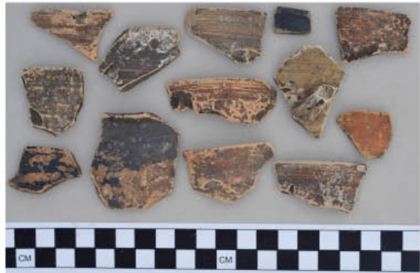
Top: a collection of Sub Mycenaean and Dark Age sherds from the altar; Bottom left: Plan of excavations in the lower sanctuary Bottom right: View of the stoa excavations

In the lower sanctuary Trench G was continued in the area to the north of the seats. Trench N was extended to the northeast of the 'xenon' exposing more of the sub-surface open air corridor. Multiple trenches, DD, EE, FF, L, M, N and O and their extensions in the area of the 67 m. long stoa revealed more of the front and interior foundations of the building as well as the western