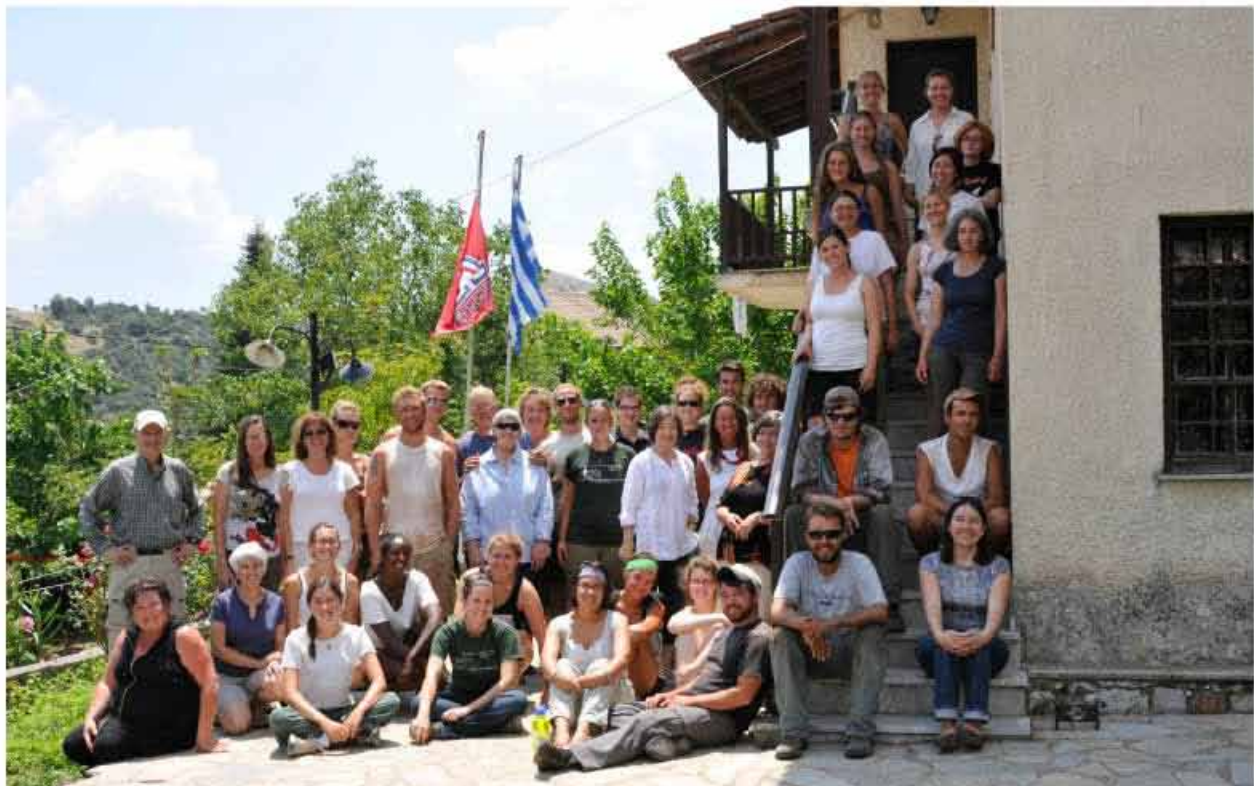
The Mt. Lykaion team outside the Dining Palace and the Ethnographic Museum of Ano Karyes.