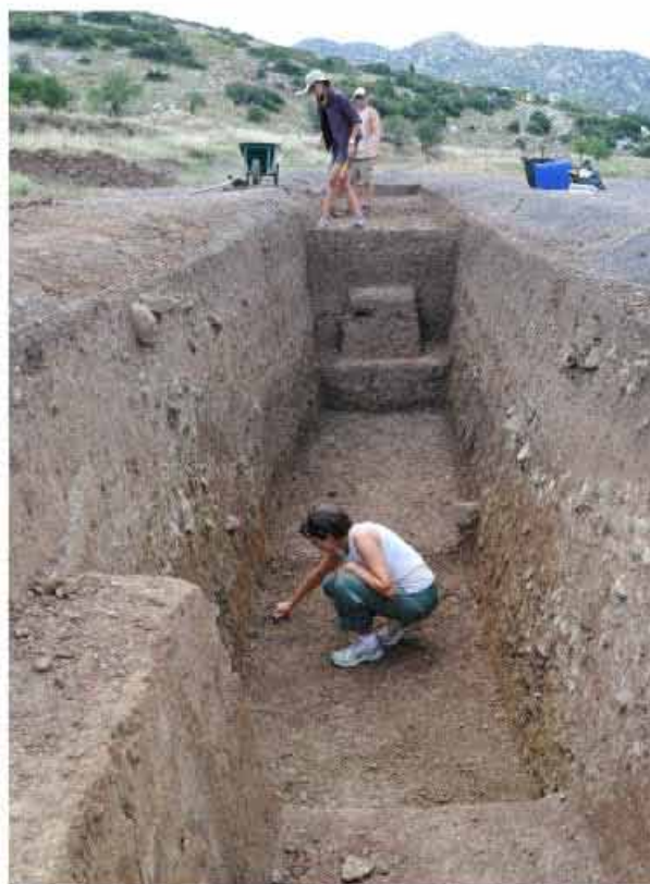
Amy Plopper digging down towards the floor of the hippodrome;