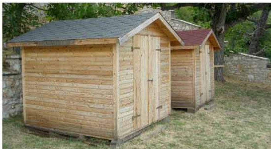
Left: Equipment used for excavation: Right: spitakia (storage sheds) to store equipment in the off-season