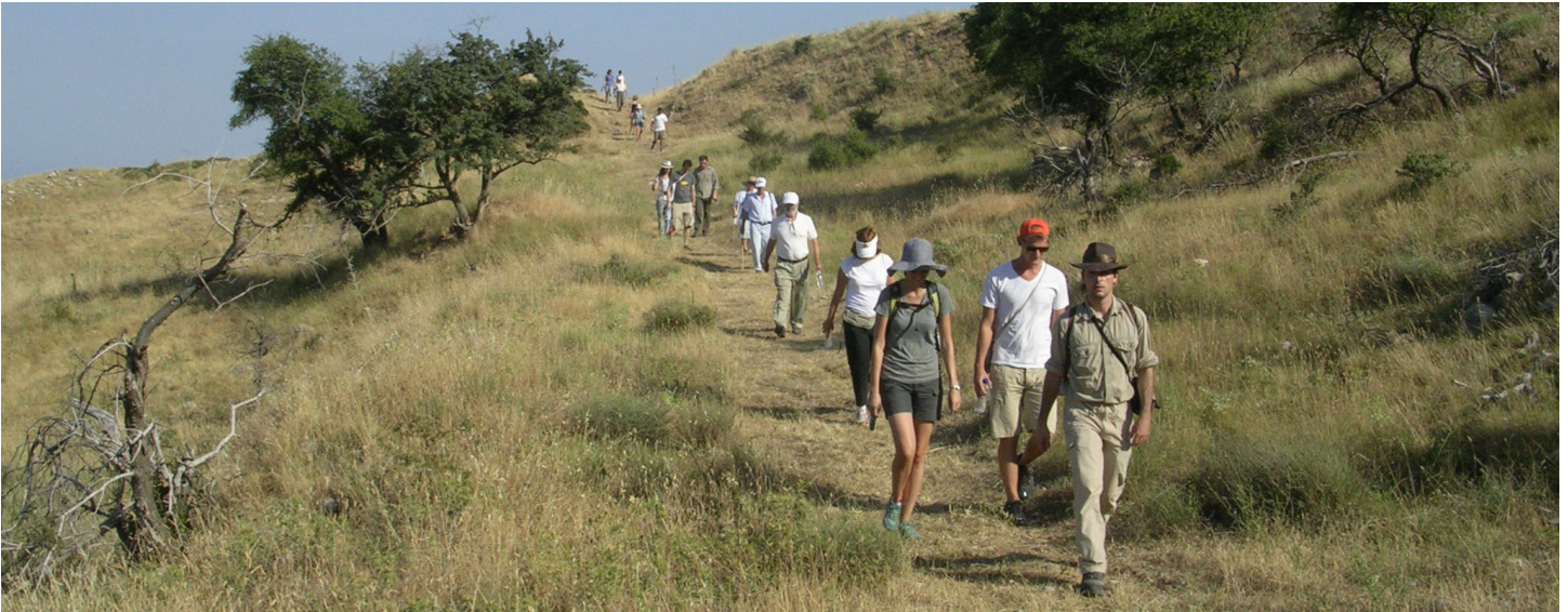
Above: Opening of the Trail of Zeus; Lower left and right: Inauguration and signing ceremony at the hippodrome.

During the field school we both directed and participated in the opening of a portion of the second trail of the park, the Trail of Zeus, from the village of Ano Karyes to the hippodrome of the Sanctuary of Zeus at Mt. Lykaion. Community leaders as well as local political dignitaries took part in the trail opening on Saturday July 14, 2012. Hikers assembled in the village of Ano Karyes at 5 pm and walked the trail that is approximately 5 km. in length.