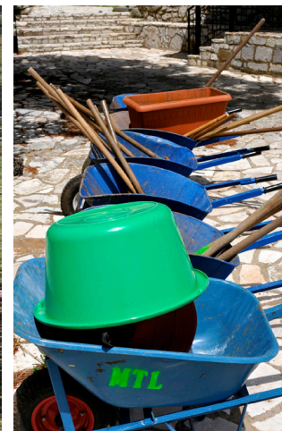
Above: Excavation scenes 2006-2010: sieving at the altar; Seats in the lower sanctuary; Wheelbarrows at the ready.